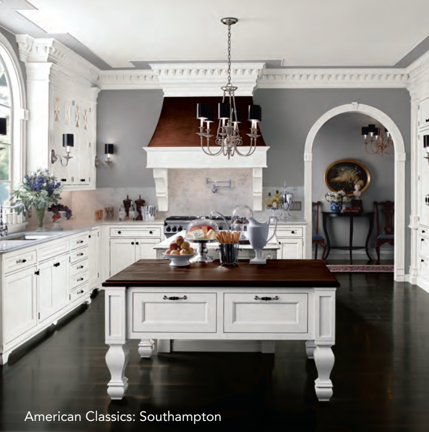
American Classics: Southampton