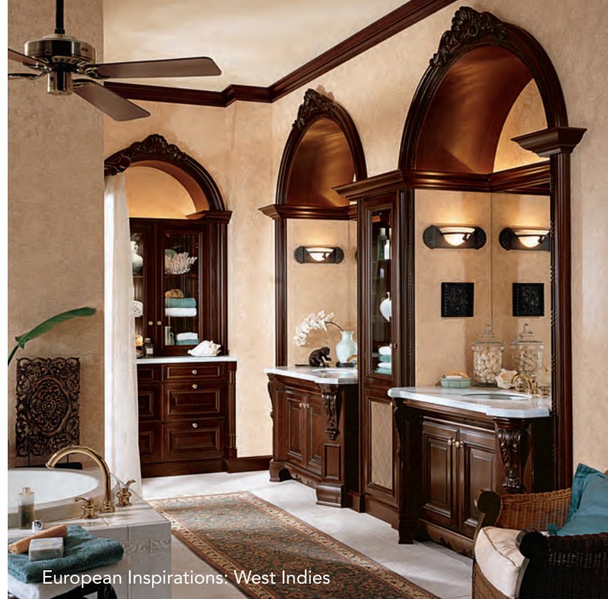
European Inspirations: West Indies