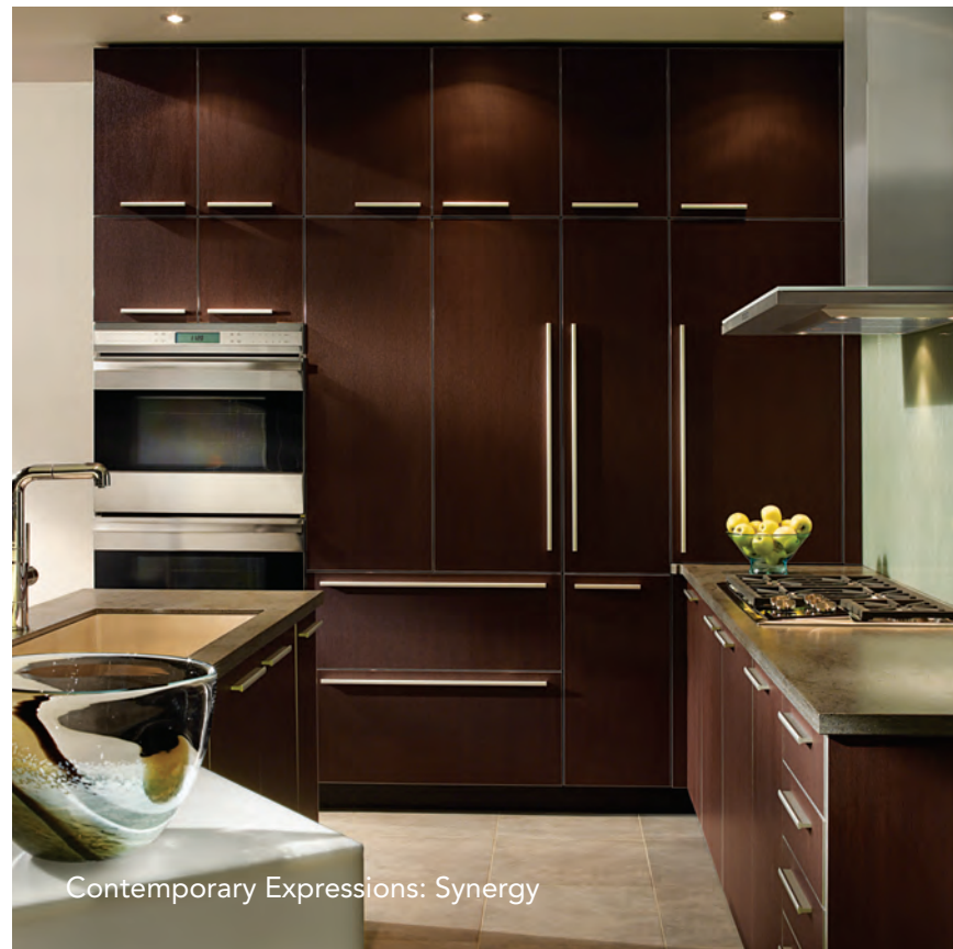
Contemporary Expressions: Synergy